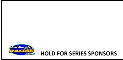
LEFT SIDEBOARD - OUTSIDE