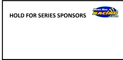
LEFT SIDEBOARD - INSIDE