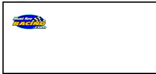
RIGHT SIDEBOARD - INSIDE