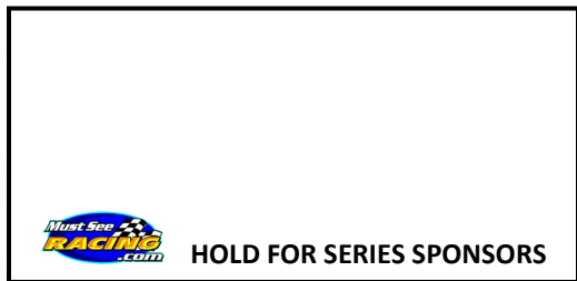
LEFT SIDEBOARD - OUTSIDE