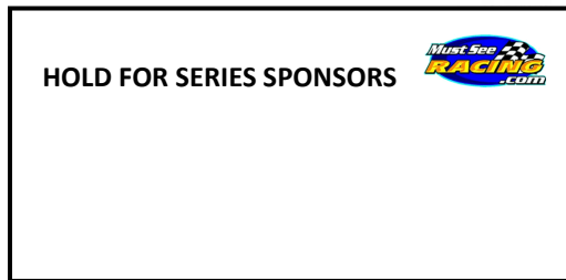
LEFT SIDEBOARD - INSIDE