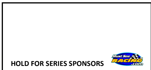
RIGHT SIDEBOARD - OUTSIDE